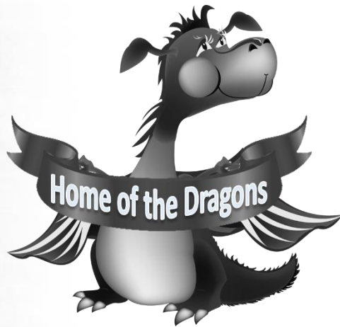
Royal blue shirt with white dragon